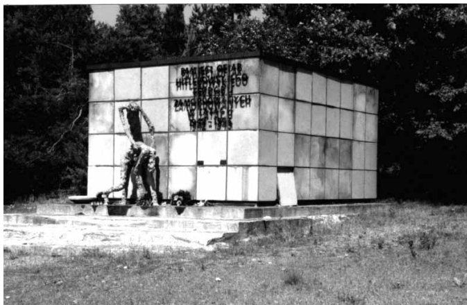
The badly preserved first memorial in Belzec in the late 1990s.