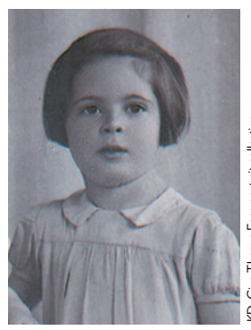
Them a Face portrait collection